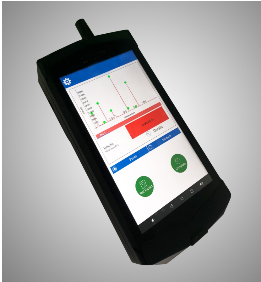
The unique Mediscreen hand held Raman diagnostics and screening module