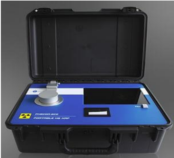
TraceTech Portable Universal Analyzer For trace elements and additives All samples solids and liquids

Wear metals and additives in gasoline, diesel, bio-fuels, kerosene and lube oil, Marine oil